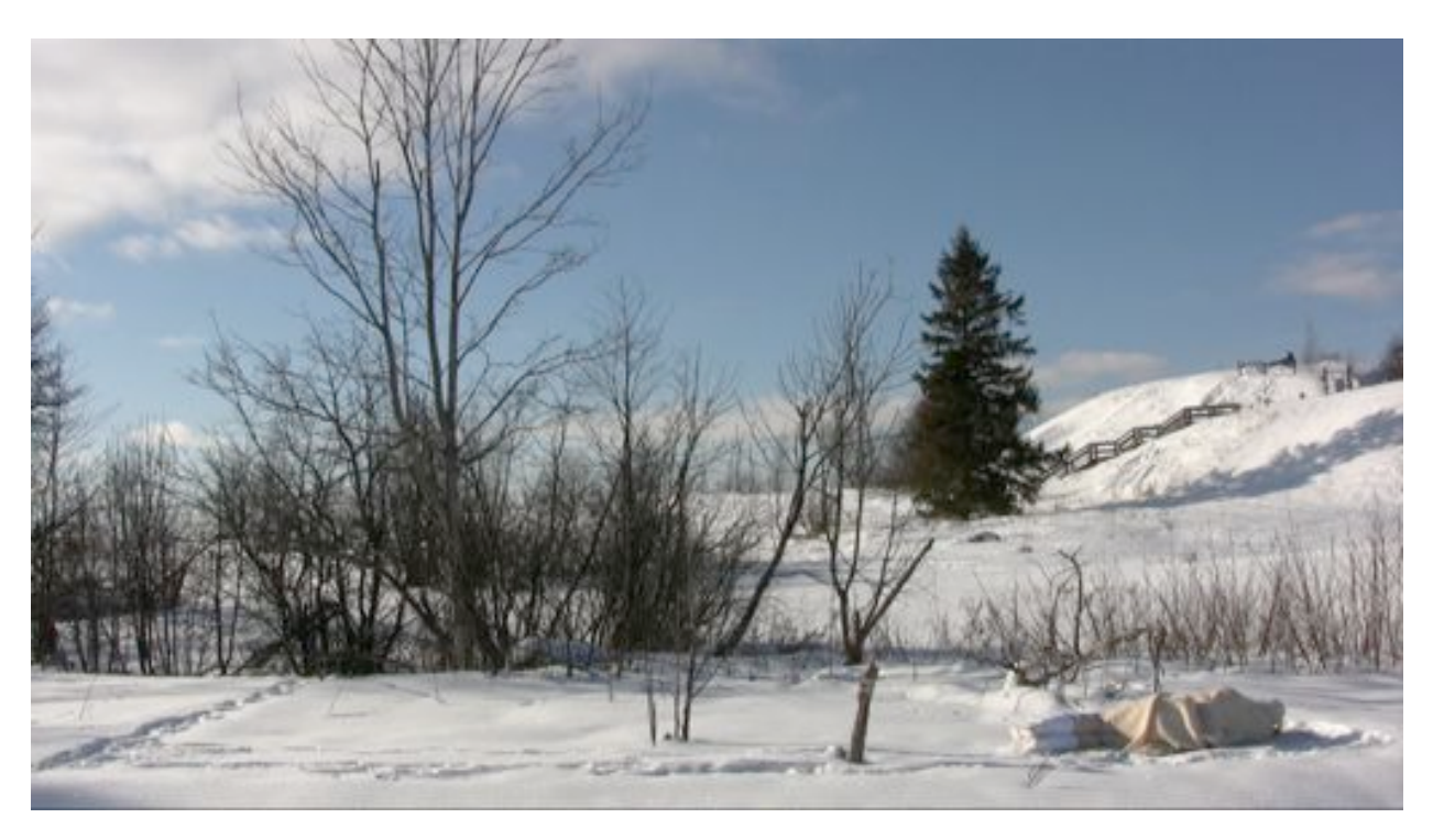
Year of the Tiger. Video Still (from east towards west), 2011