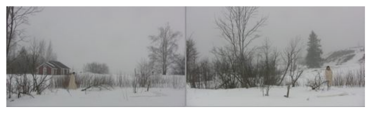
Year of the Tiger. Video Still, 2011