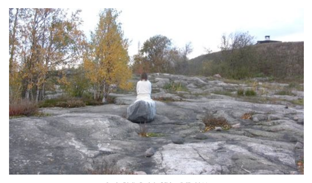
On the Bird's Rock 3. Video Still, 2011