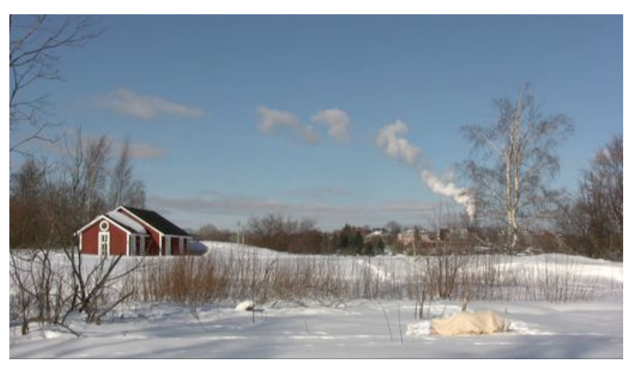
Year of the Tiger. Video Still (from south towards north), 2011