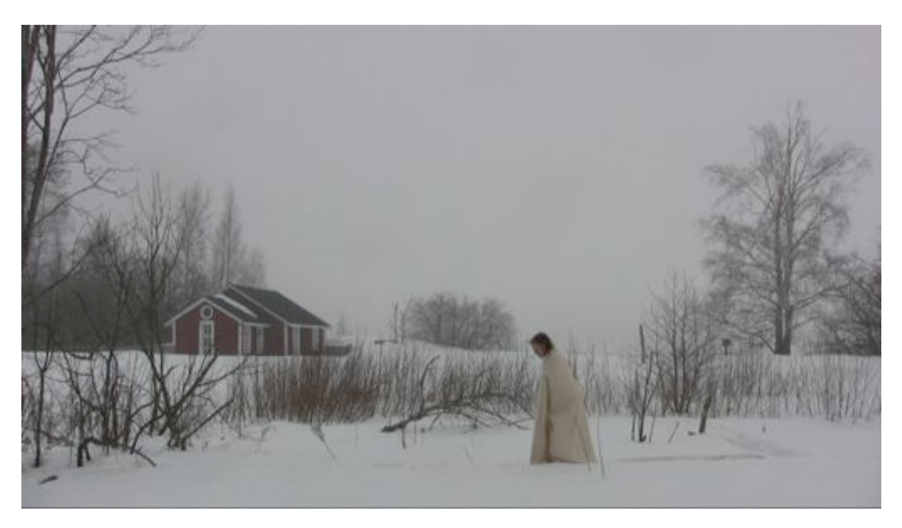
Round the Tiger. Video Still, 2011 Image Credit: Annette Arlander