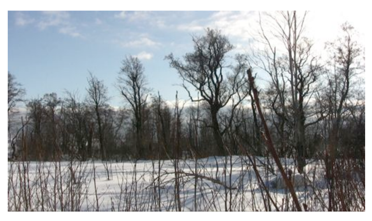
Year of the Tiger. Video Still (from north towards south), 2011