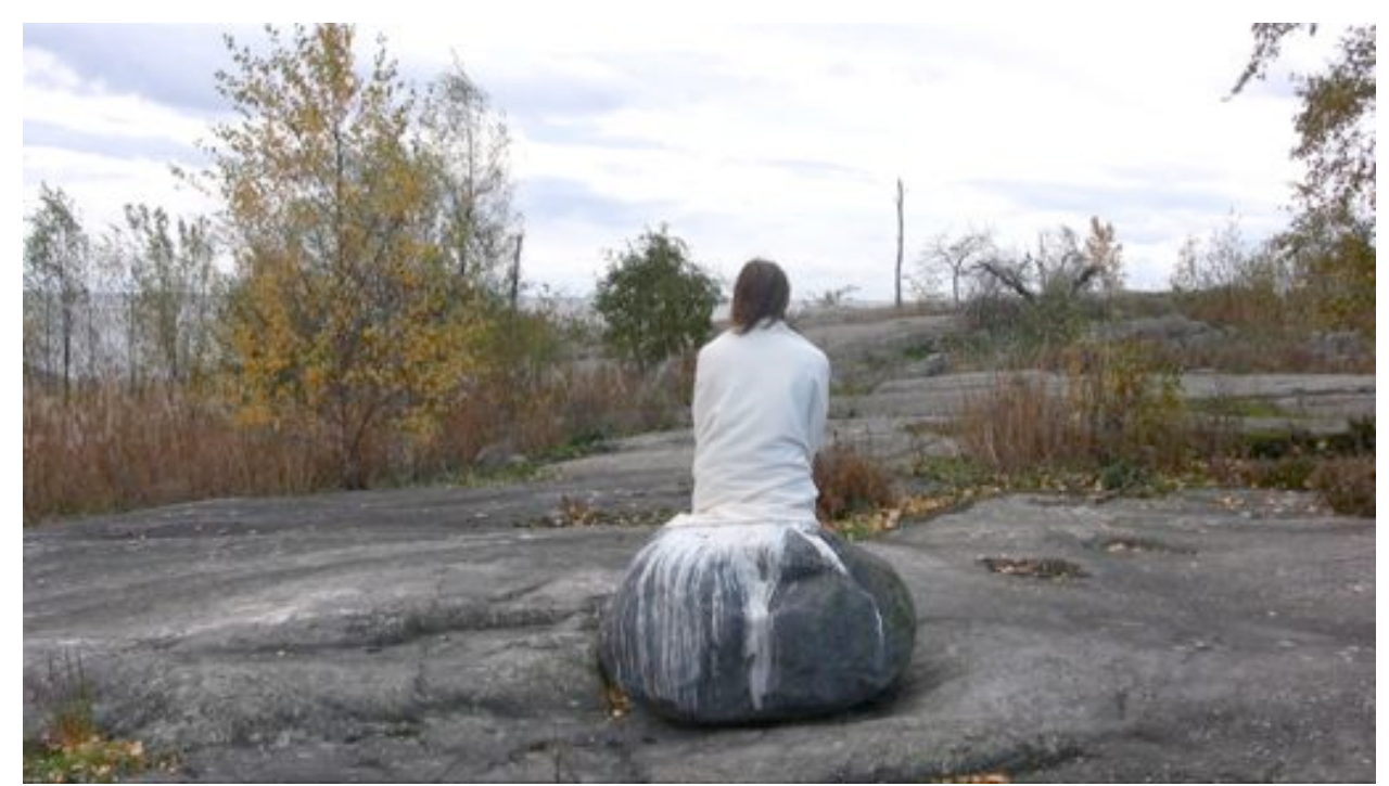
On the Bird's Rock 2. Video Still, 2011