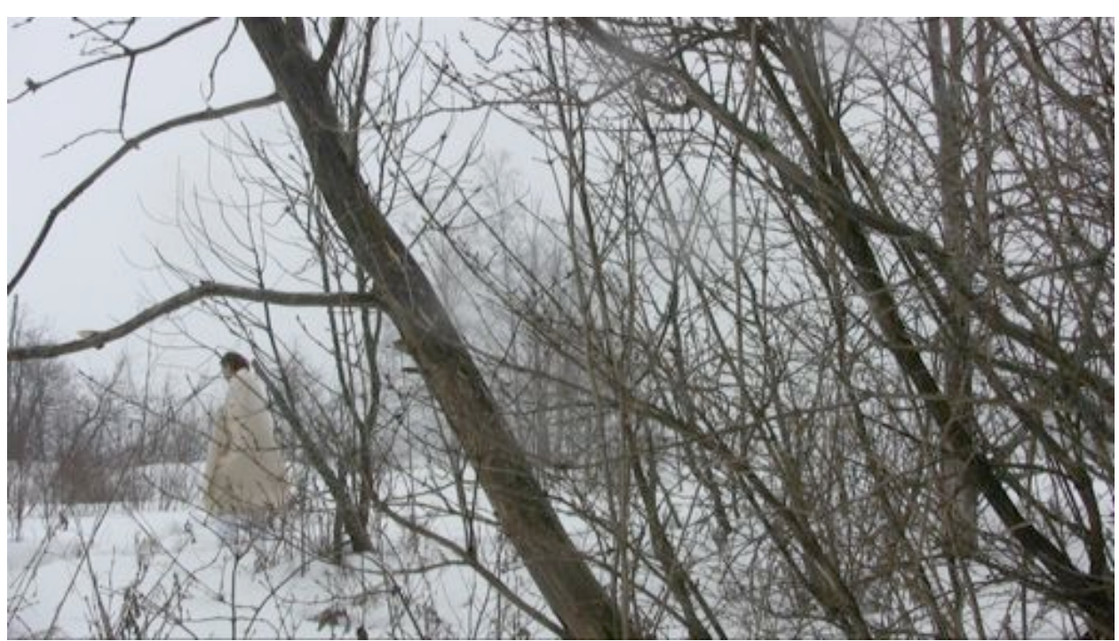
Round the Tiger. Video Still, 2011