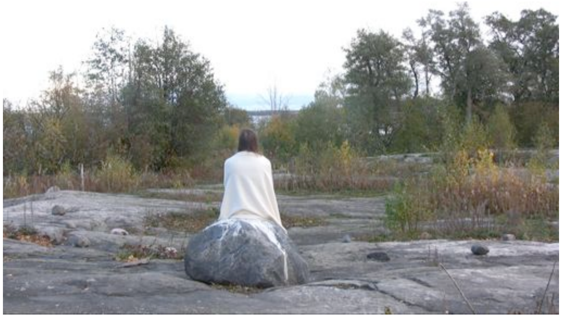
On the Bird's Rock 2. Video Still, 2011

In terms of the possible effects on current discourses on art or artistic research, the impact of the creation process has so far been rather small; I have described it only in a few contexts, and this is the first published account. In terms of damage to the environment, the impact was fortunately small, too. The affective impact of the creation process on the performer, however, albeit difficult to ascertain, was more noticeable. The impact of the artworks (like all artworks capable of producing new events) however, cannot be determined in advance. To my knowledge the video installations have not produced strong material, discursive or affective reactions or other effects, yet. Fortunately their future and potential impacts remain open. Paradoxically and problematically their survival and future life depends on their existence in the form of digital representations, as inanimate objects.