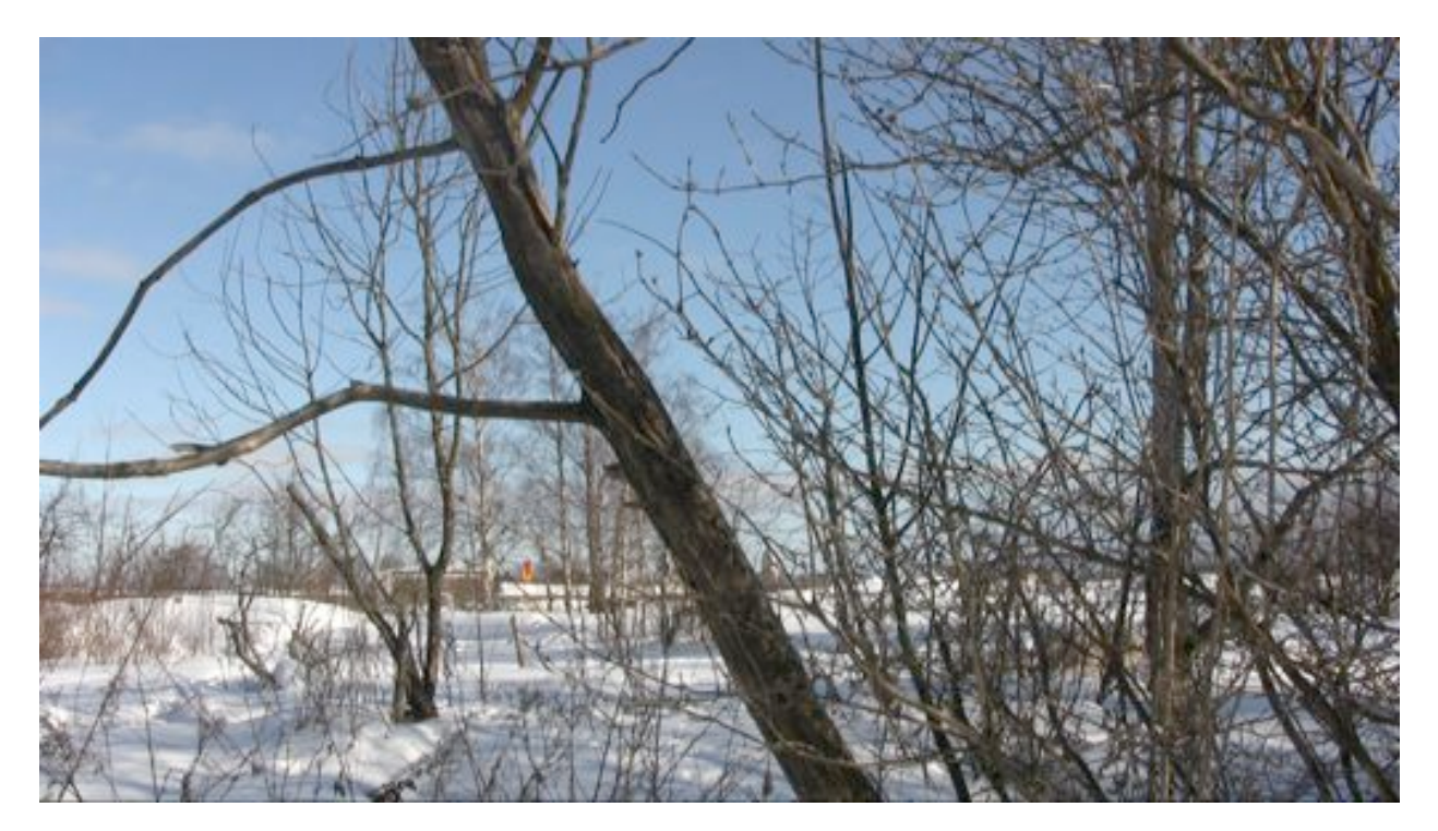
Year of the Tiger. Video Still (from west towards east), 2011