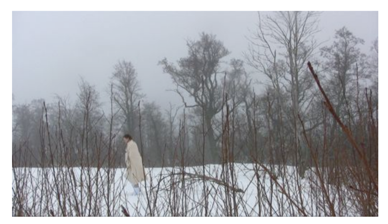
Round the Tiger. Video Still, 2011

A third variation, called Day and Night of the Tiger - in the Year of the Rabbit , was performed at midsummer 2011 for 24 hours with three-hour intervals, on the ruins of a smaller building near the original stone base, and with some spoken descriptions recorded.<sup>11</sup> This time I repeated the action only once each time, and video recorded it from one side only – all in all, only twelve times. Instead of changes in vegetation, the changes in light conditions dominate in this work; during midsummer in Helsinki it is dark only for a few hours every night. In addition, I video recorded some small studies of sitting in the landscape. I was looking for affinities between my white scarf and details in the environment, from the salt on the seashore to bird droppings on the rocks. One of these studies, On the Birds' Rock , explores the idea of four perspectives on the same landscape. In it I sit for a moment with a white scarf on a rock that is covered in white bird droppings, turning my back to the camera on a tripod. This is repeated four times, recorded from four directions.