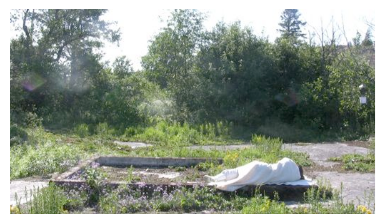
Day and Night of the Tiger. Video Still, 2011