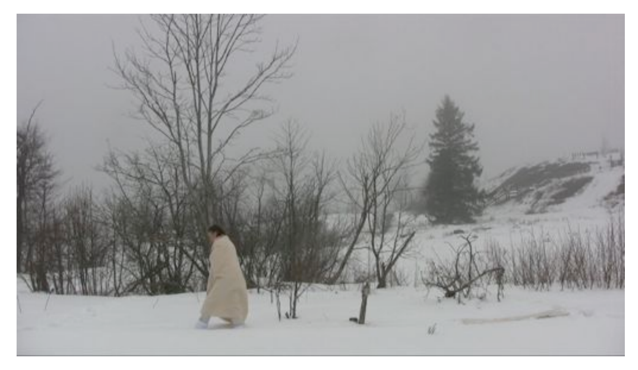
Round the Tiger. Video Still, 2011

In contrast to the four-channel video installation, a one-channel video work called Round of the Tiger documents only one session, in wintertime, and reveals how the work was made. It shows me walking in a square, wrapped in an off-white scarf, the woollen blanket of a Berber woman, moving a small mat, a whitish rag rug, from one corner to the next, lying down and getting up again, struggling in the snow.<sup>10</sup> One round consisted of the following actions: I picked up the blanket and wrapped it around me, walked in a square on the remains of the stone base until I came to the rug in one corner, lied down on the rug for a while, then continued walking one more round, picked up the rug and moved it to the next corner, left the blanket in the following corner and thus finished the round. Then, after moving the camera and tripod to the next side of the stone base, I repeated the actions. Thus I recorded the same sequence of actions four times, from four different directions; first with the camera in the east facing west, then in the south facing north, then in the west facing east, and finally in the north facing south. The performance involved walking around the stone base and lying down on the rug four times during each session. These sessions were repeated once a week for a year.