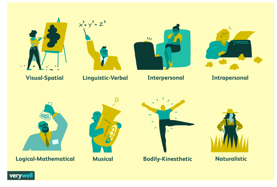
Illustration of eight types of intelligences, according to Howard Gardner