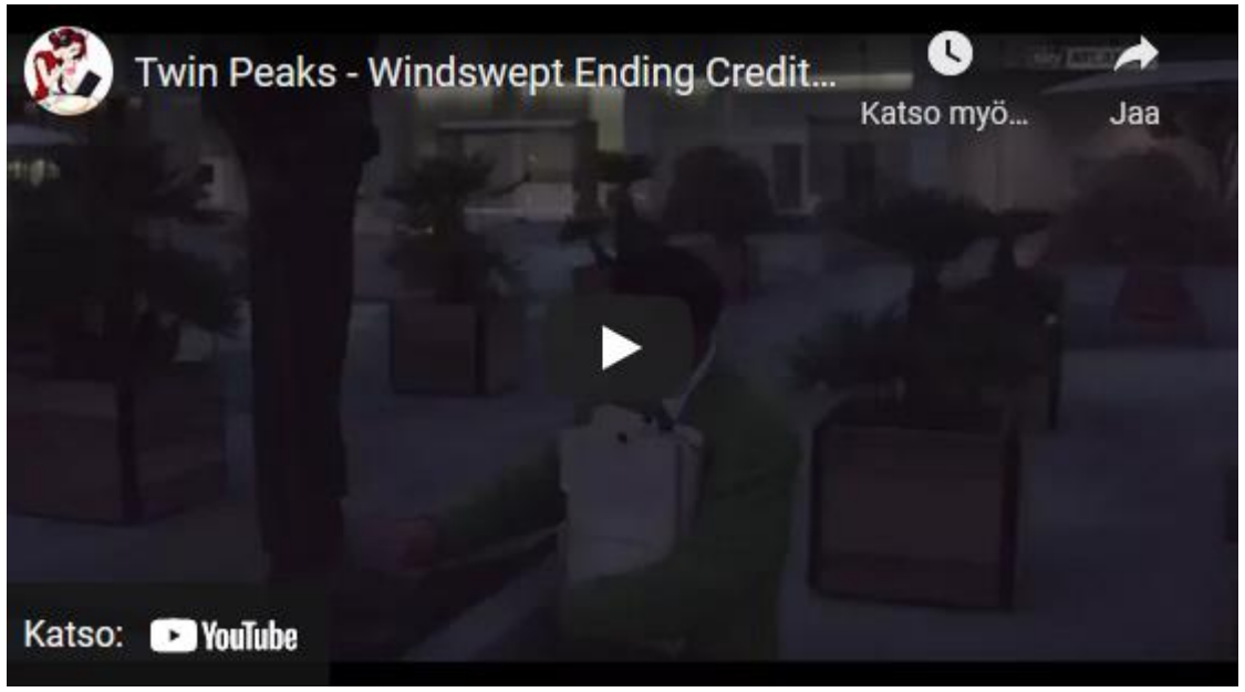
Video 3. Ending credits of Twin Peaks: The Return, Part 5.

our cameras and screen-based interfaces in digital culture, allows to reduce movement to segments that can be codified, first in strict behavioural patterns and architectures" (Del Val 2020, 315).