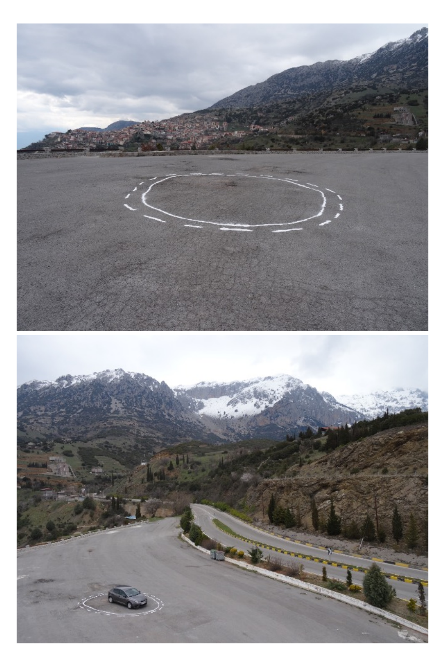
Fig. 1 © James Bridle: Autonomous Trap 001, 2017, installation <a href="http://jamesbridle.com/works/autonomous-trap-001">http://jamesbridle.com/works/autonomous-trap-001</a>

Similarly, digital recordings of classical music are aesthetically classical music not digital art. Yet Man Machine by Kraftwerk [17], produced on analogue synthesizers and published on vinyl in 1978, is undoubtedly computer music , i.e., digital art of type 4. Music made with Synthesizers sounds digital or electronic because it sounds different from "acoustic" music. We might have learned to group such sounds as electronic through habit: Early electronic music, has "taught us" to recognize electronic music as such, even if produced with analogue circuitry.