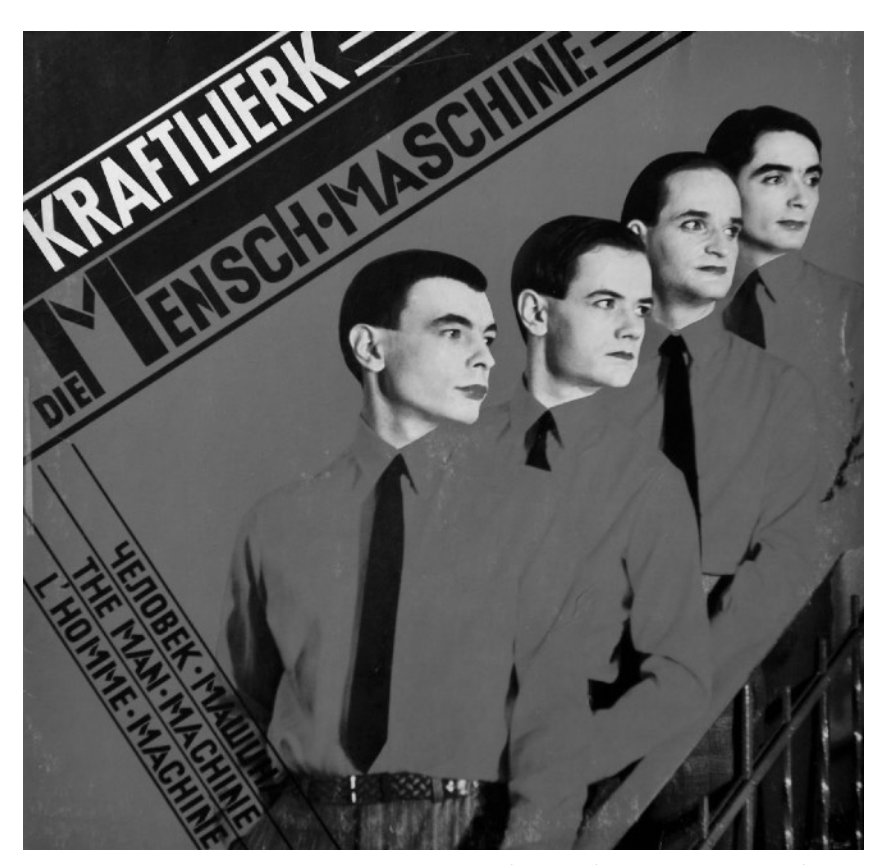
Fig. 3 Mensch Maschine, (Cover art for Kraftwerk's album of the same name, by Karl Klefisch. © Kling Klang 1978)

Even though the use of blockchain technology can seemingly make datasets unique, the uniqueness is not in the experienceability of what the dataset encodes, but solely the uniqueness of the code. So an identical copy of the encoded artefact would still be possible — the blockchain (like a signature) would need to be consulted to verify its uniqueness. In a simile, the non-digital non fungible token equivalent of the Mona Lisa would be an arbitrary number of identical paintings, where only one bears the original signature by Leonardo da Vinci.