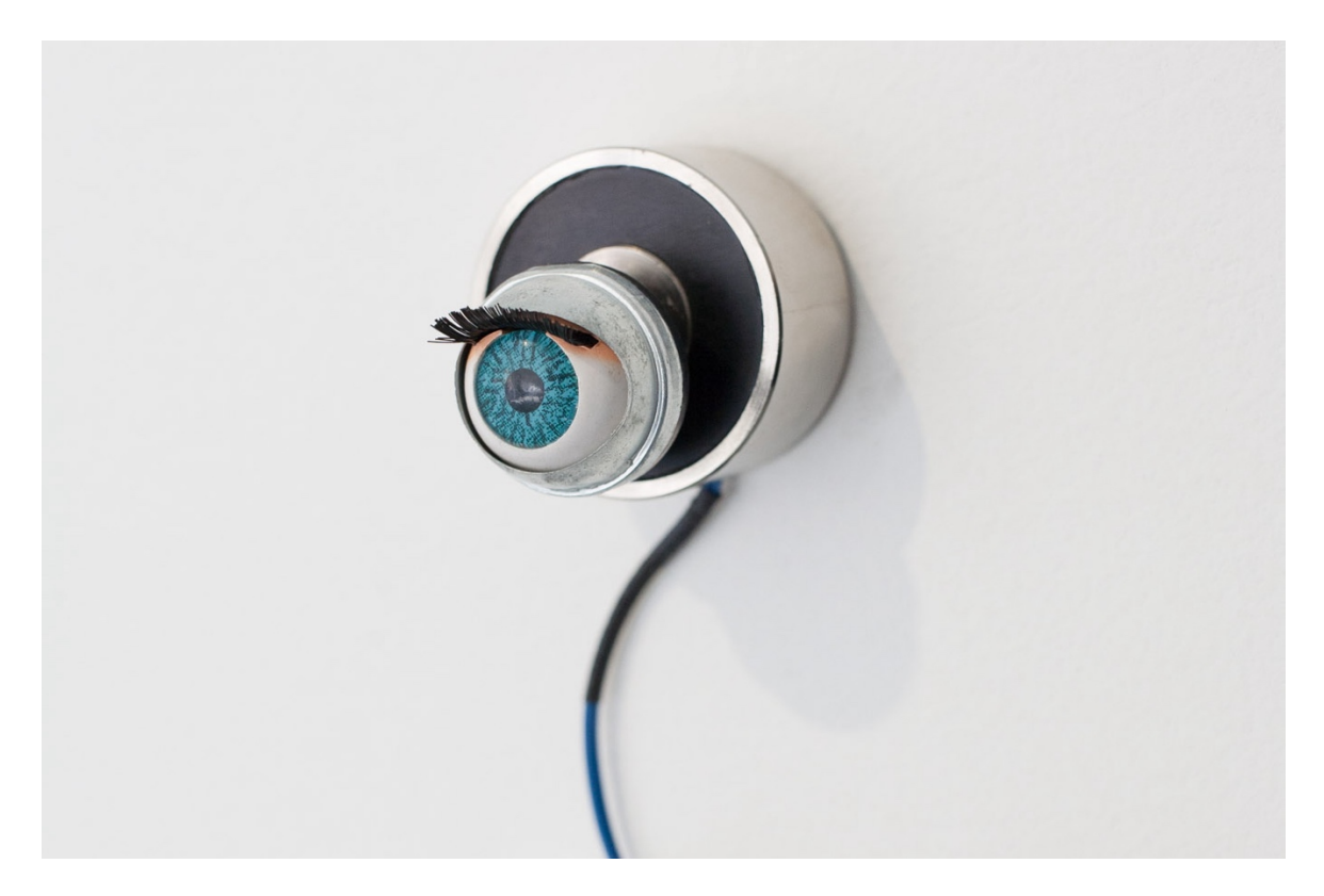
Figure 1: Detail of the installation IIOO IS NOT HERE