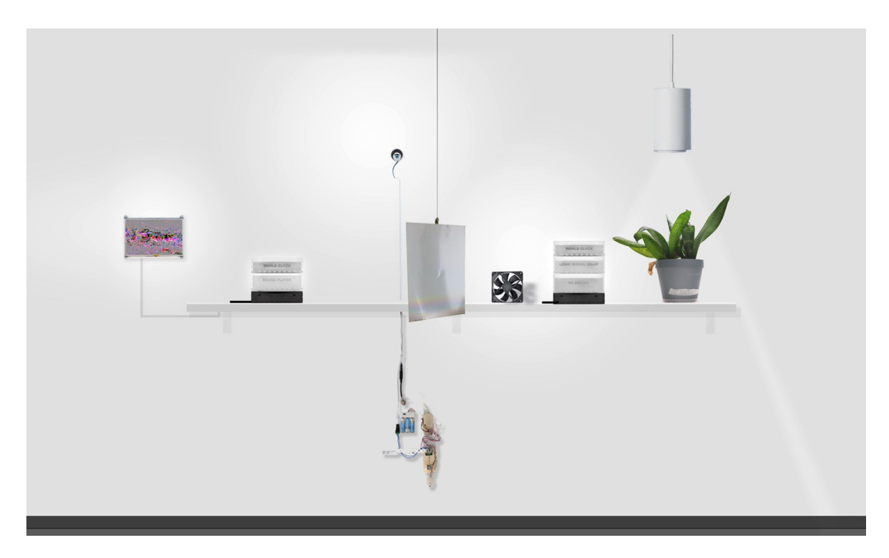
Figure 2: Illustration of the installation IIOO IS NOT HERE