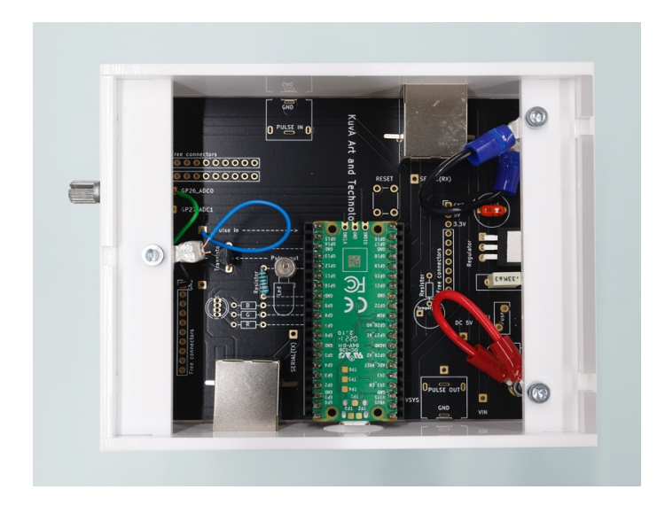
Figure 4: Detail of the Pino module from the top without lid. This configuration is equipped with custom made shild for Raspberry Pico microcontroller.