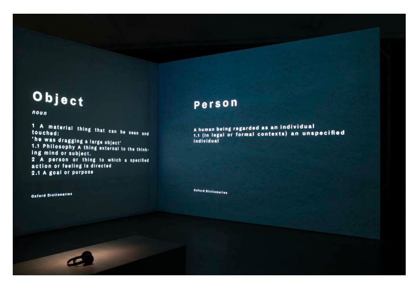
Figure 1. As one excavated concept in MoN , Gustafsson&Haapoja study "person" through debating the object–person dichotomy.

A more spacious installation room is occupied by Becoming , a three-hour, threechannel video work offering a meditation on how humans could better coexist with one another and with other lifeforms. The video consists of interviews with scholars, artists, activists, and other individuals such as children, who Gustafsson&Haapoja have found essential for reimagining human societies and human-nature relationships from a more sustainable and ethical viewpoint. Questions—including how to live, how to listen, how to love, and how to die—create a central focus of the interviews. The interviewees could decide which of thirty-one questions they answered, and were encouraged to create questions of their own (GH 2020). The video is pieced together from headshot