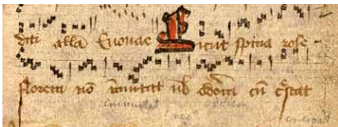
FIG. 1: Sicut spina rose florem, from Antiphonarium Tammelense (TA), MS ÅAB D 71/161, fols 90rv.

The second case study includes contemporary sources of the Cantus Sororum from the dioceses of Linköping and Turku, the three great responsories from the officium, compassio Mariae virginis . The feast day is found in four of my comparative sources: the Karjalohja and Tammela antiphonaries from Finland and two processionsals from the C-collection in Uppsala University Library. They are all dated to the fifteenth–sixteenth centuries. 30