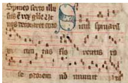
FIG. 2: Sicut spinarum vicinitas florentis , from Cantus Sororum , Helsinki, National Library of Finland, F.m. IV 132, fol. 10v. By permission: National Library of Finland.

Friday's first great responsory Sicut spinarum is an example of Petrus of Skänninge's creative work in addition to the seven great responsories not found in the older repertoire. The upper example (fig. 1) is a rhymed chant from the Tammela antiphonary, Sicut spina , and below (fig. 2) is the Cantus Sororum version. The