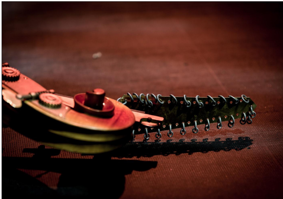
Figure 6: Buzzer attached to the scroll of the double bass.