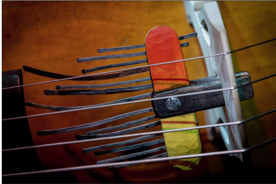
Figure 3: A custom-made Ilimba (thumb piano) attached to bass bridge.