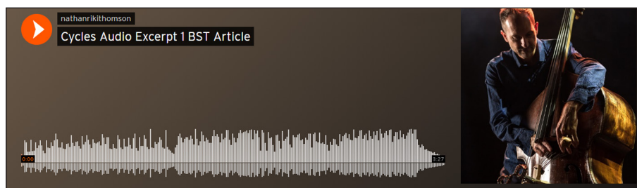
Excerpt 1: Cycles (audio).

In the following examples, we would like to highlight the interplay of transcultural and technological elements through three musical excerpts.