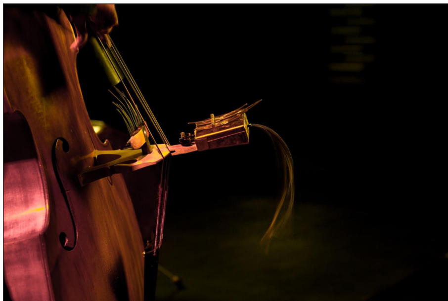
Figure 4: Thumb piano and a brass cow bell with added thumb piano keys and a spring designed by Juhana Nyrhinen.