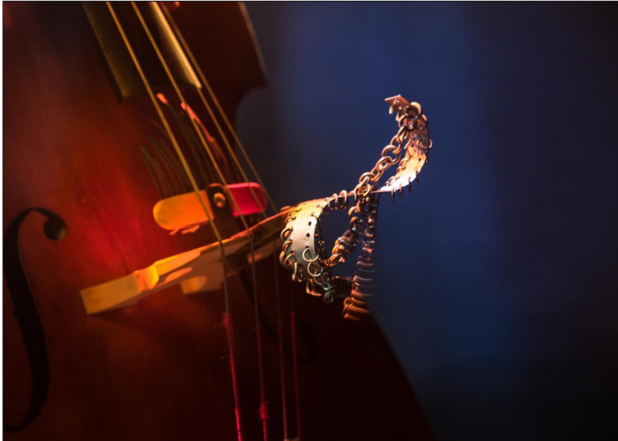
Figure 5: Buzzer and thumb piano attached to the bridge of the double bass.