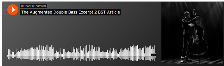
Excerpt 2: The Augmented Double Bass (audio).

A specially developed technique is employed, which involves inverting the hands (right above the left) and uses the thumb of the right hand to pluck the strings, as well as a circular arm motion in order to create percussive sounds on the body of the bass. An ankle shaker is worn around the right leg, and the player's voice is used percussively. These attachments and techniques were developed to emulate and re-imagine the sonic aesthetics of the Wagogo ilimba (thumb piano) and Kurya Litungu (plucked lyre) from Tanzania on the double bass. This process gives rise to new music and an expanded view of the role and sonic possibilities of the double bass, which in turn become integrated into the player's personal sonic identity.