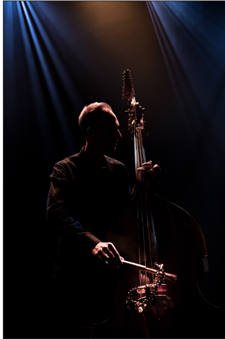
Figure 9: The double bass with a set of preparations attached.

The setup involves ‘active acoustics’ technology and technique stemming from the second author’s research, as previously published in (Esqueda et al. 2018, Lähdeoja 2016), as well as custom-made buzzers, shakers and bass bridge-mounted Ilimbas (thumb pianos) developed by author one in collaboration with the luthier Juhana Nyrhinen, as depicted in the following photos (see Figures 1, 3, 4, 5, 6, 8 and 9 ).