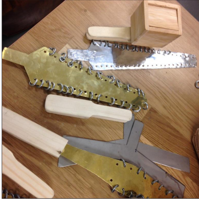
Figure 1: Early stages of building metal buzzer attachments for the double bass.