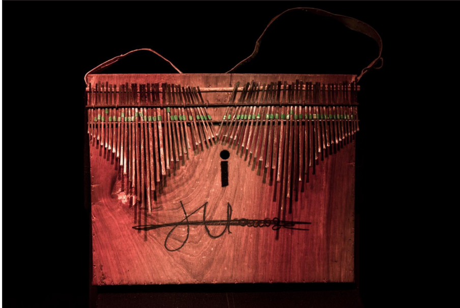
Figure 2: Traditional Wagogo ilimba (thumb piano) from Tanzania.