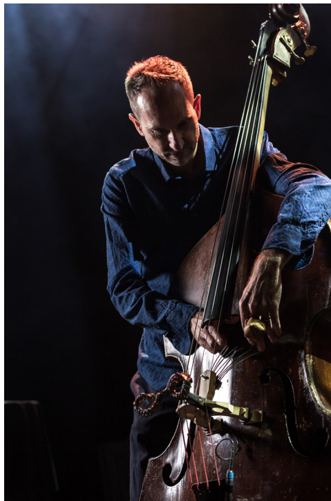
Figure 8: The double bass with a set of preparations attached.