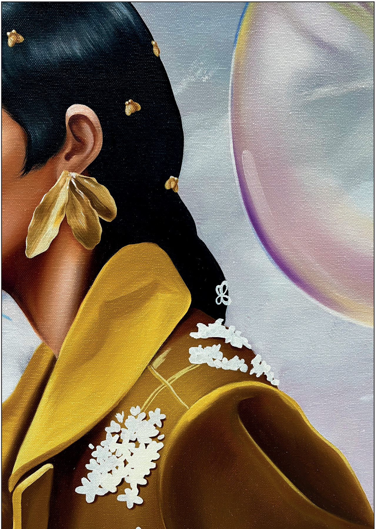
Detail from the painting More Than You See Oil on canvas