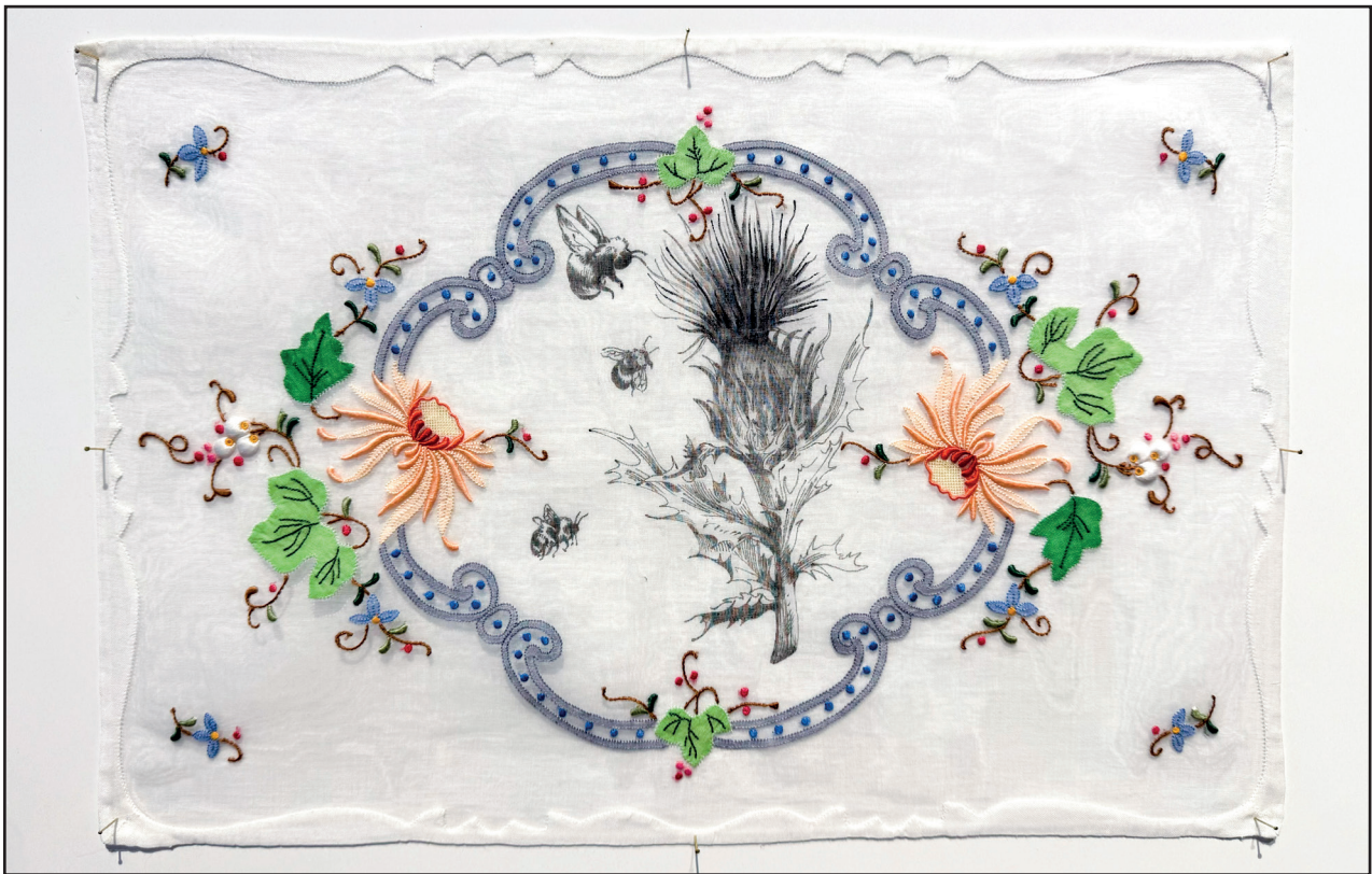
Silk artwork Nature , 2025 Hand embroidered silk and silk painting, 41x28,5cm