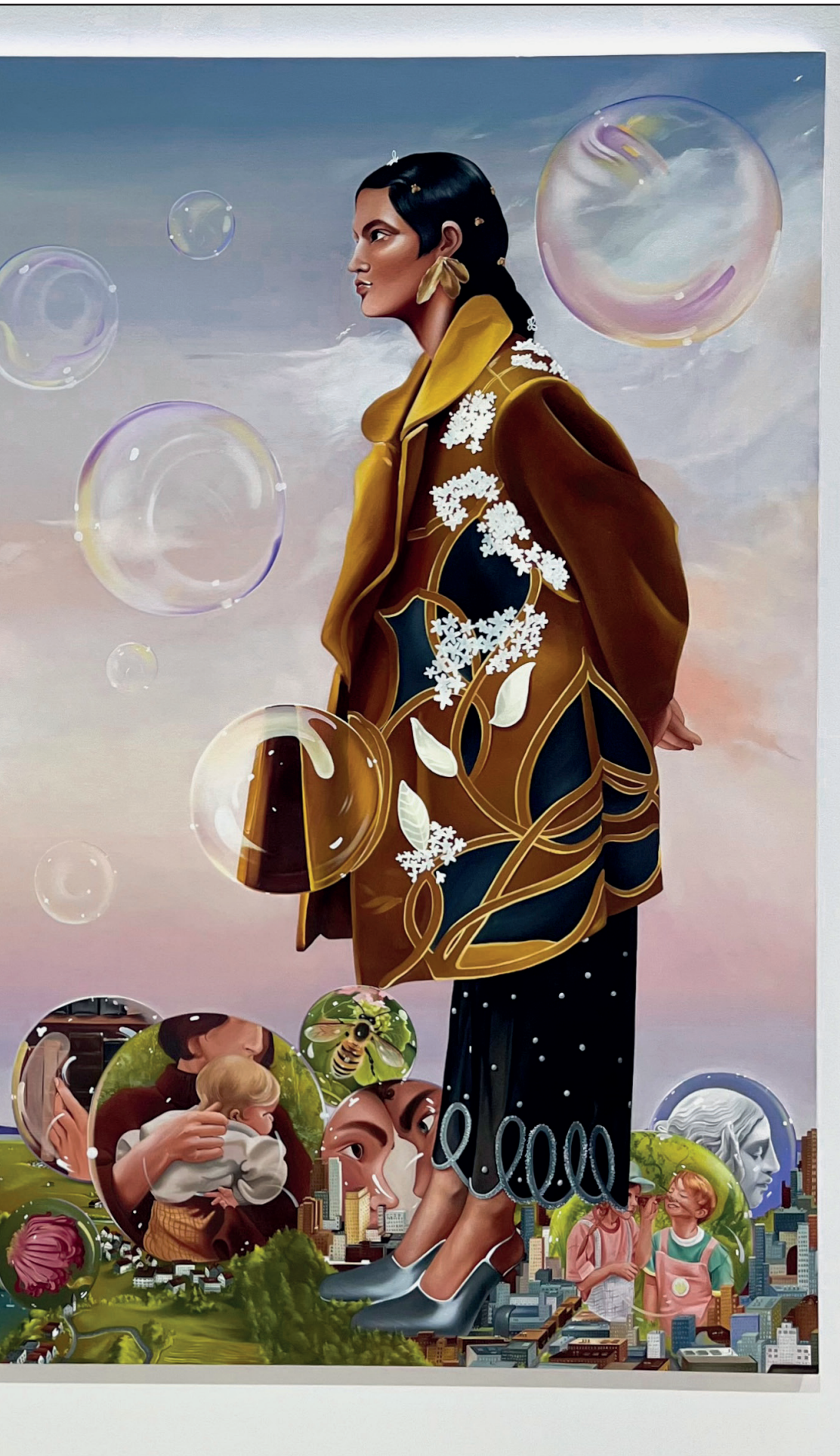
Installation view of my artistic works exhibited in Kuvan Kevät 2025, Photographer: Lal Doga Karakas