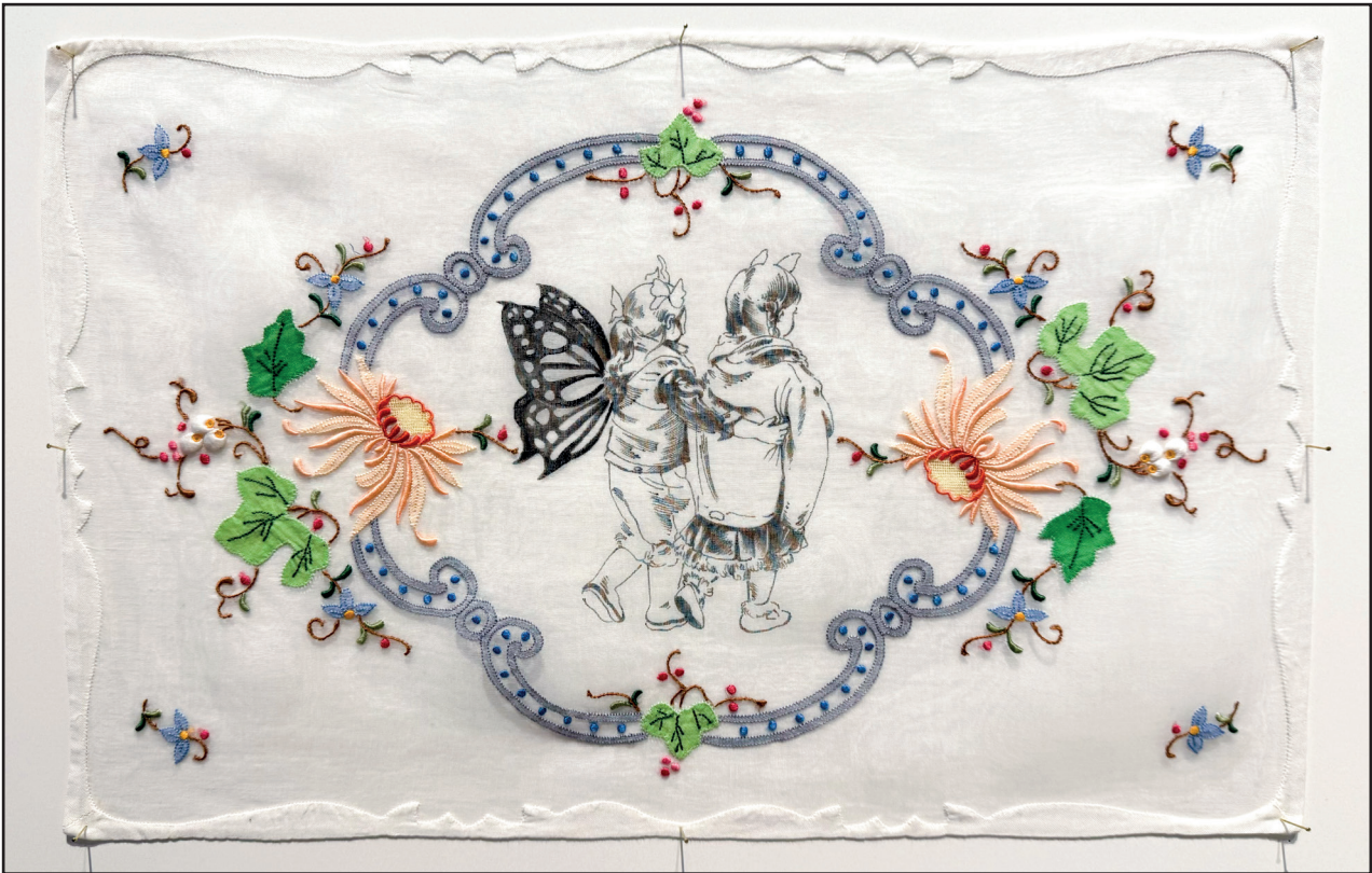
Silk artwork Friends & Family , 2025 Hand embroidered silk and silk painting, 41x28,5cm