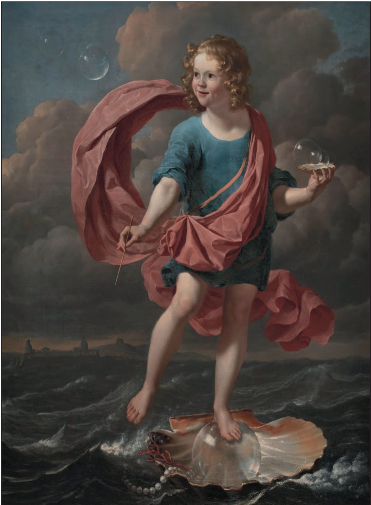
Karel Dujardin, Boy Blowing Soap Bubbles. Allegory on the Transitoriness and the Brevity of Life , 1663, Oil on canvas, Statens Museum for Kunst, Copenhagen. https://open.smk.dk/en/artwork/image/KMSsp561?q=bubbles&page=0 .