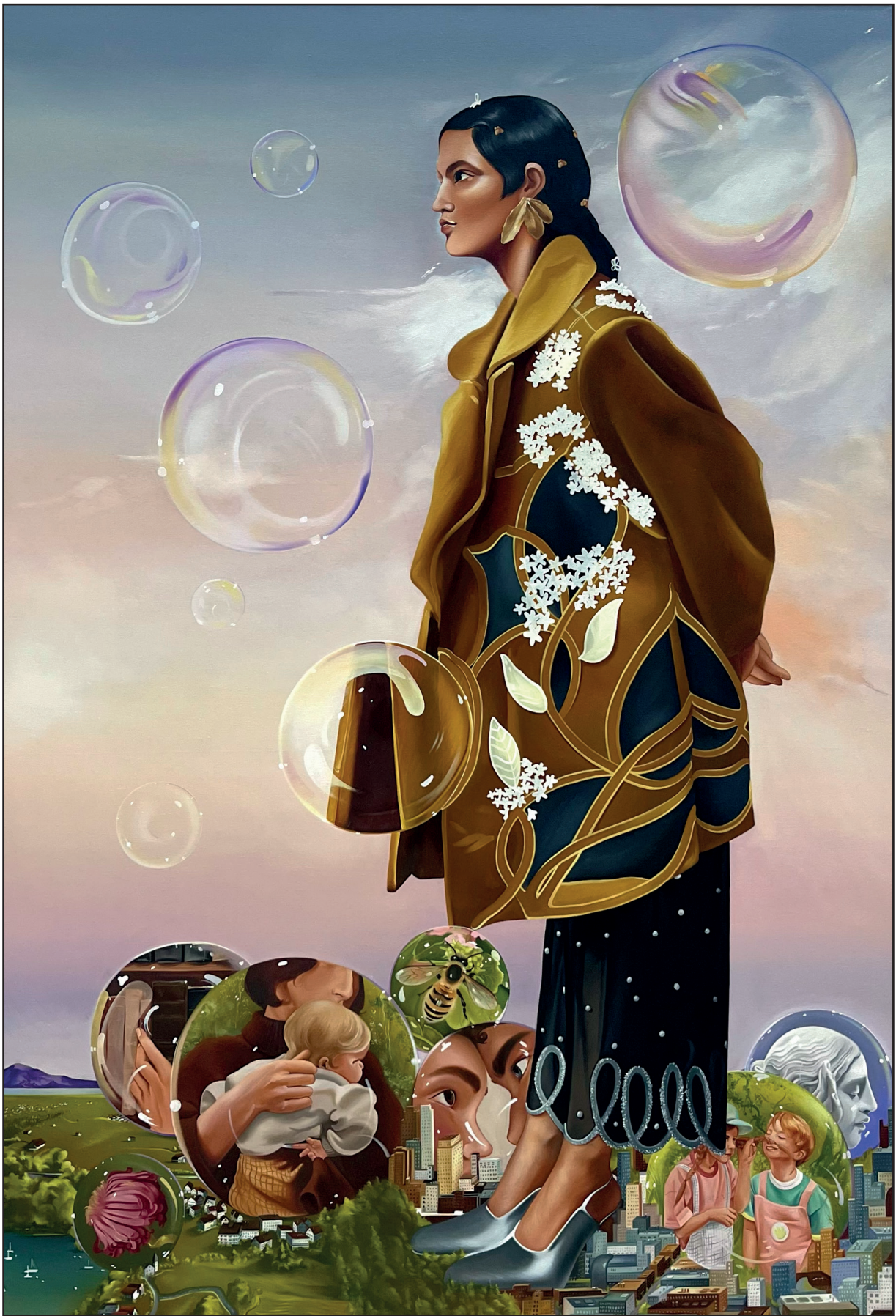
More Than You See , 2025, Oil on Canvas, 2,10x1,45 cm