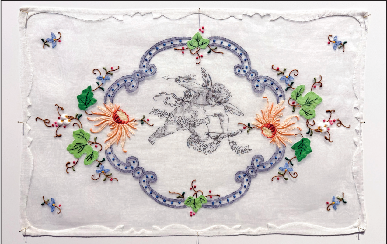
Silk artwork Love , 2025 Hand embroidered silk and silk painting, 41x28,5cm