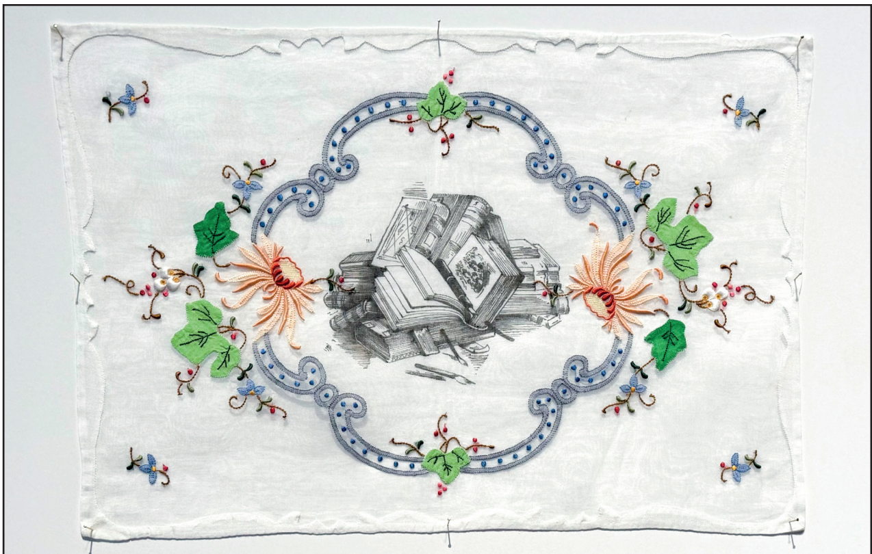
Silk artwork Art & Knowledge , 2025 Hand embroidered silk and silk painting, 41x28,5cm