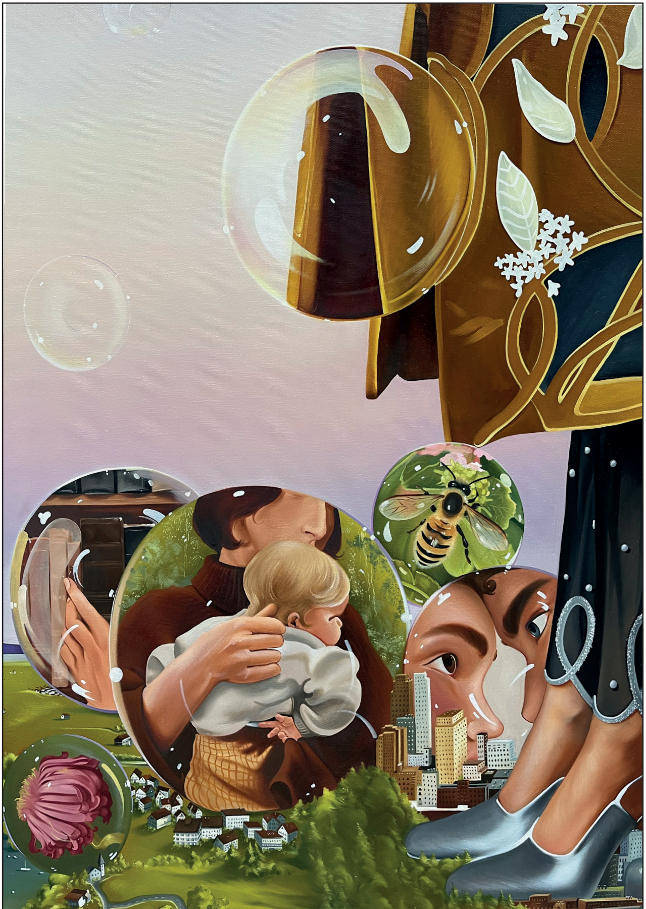
Detail from the painting More Than You See Oil on canvas