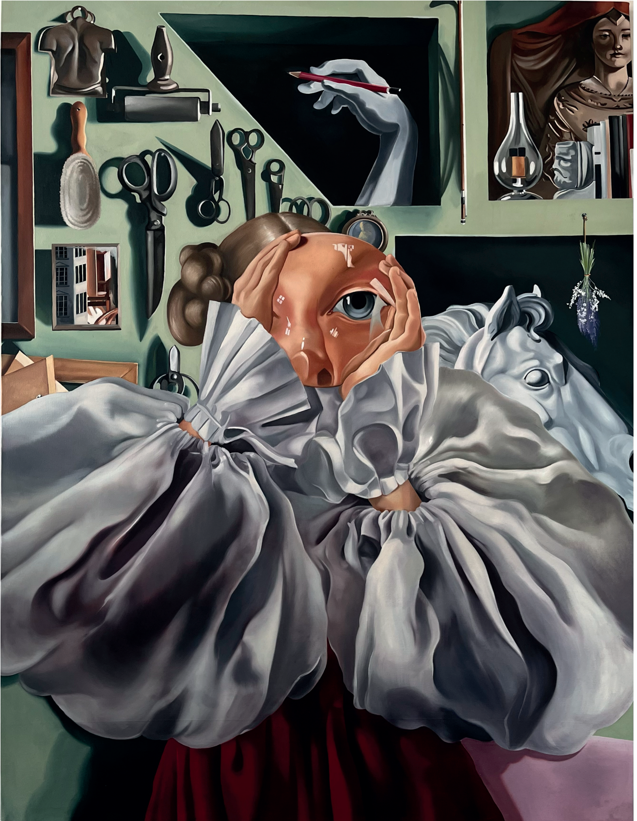
Curiosity , 2024, Oil on Canvas, 2,03x1,50 cm