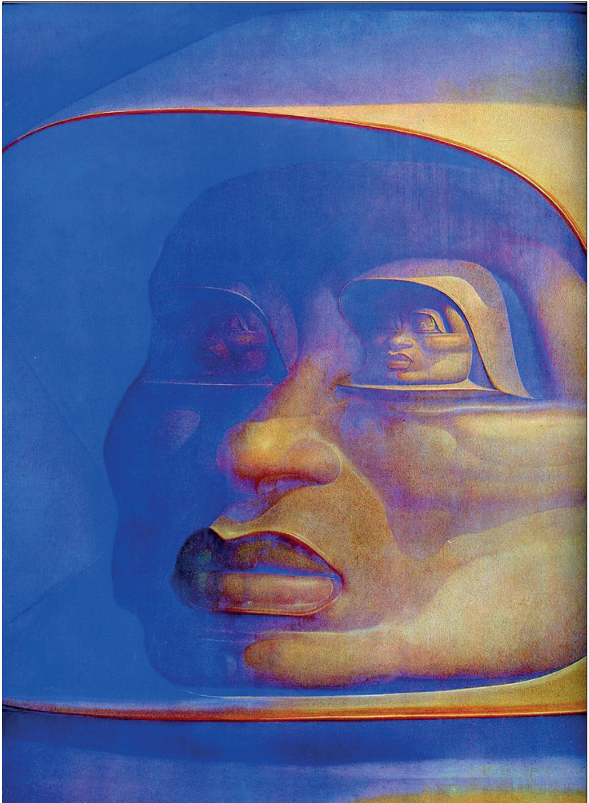
Ernst Fuchs, Observer Infinitor , 1972. Oil on wood. Private collection.