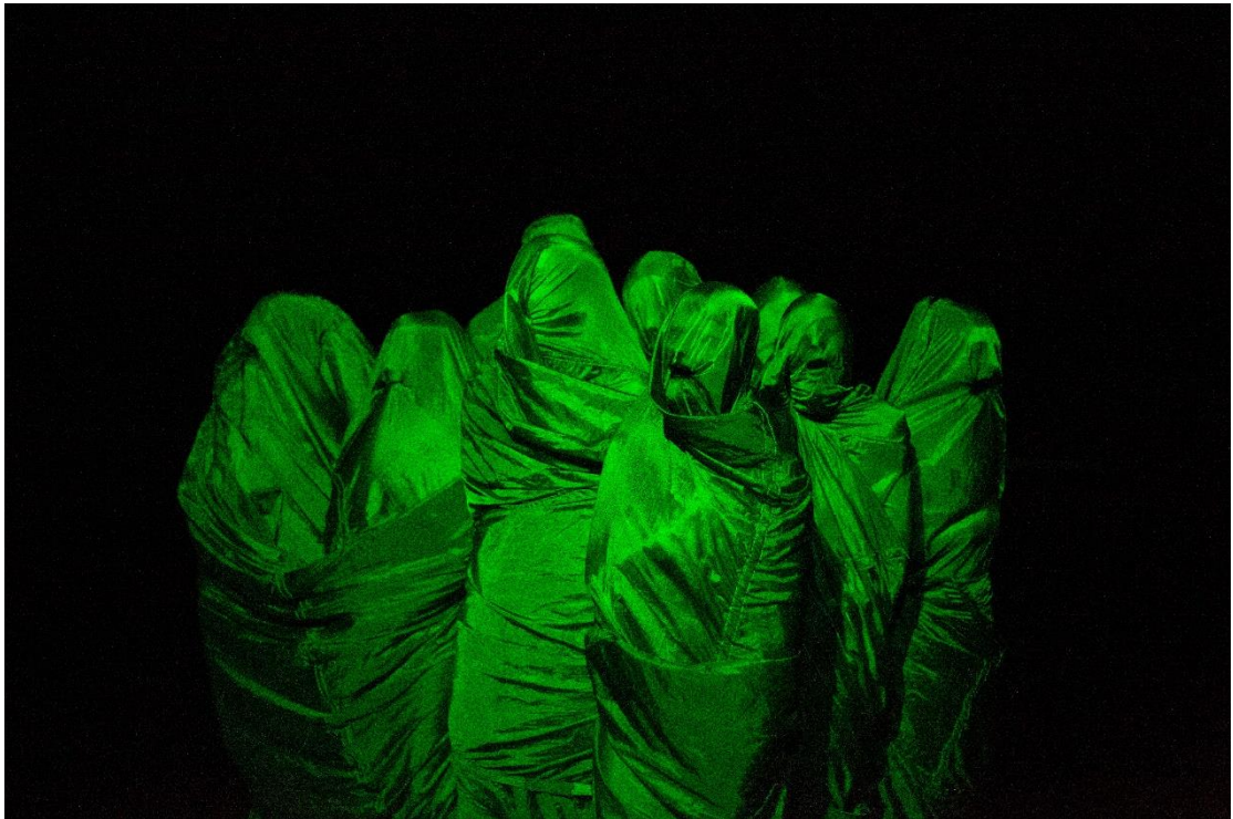
Their Limbs Their Lungs Their Legs.

Their Limbs Their Lungs Their Legs is the result of the course TADaC, which is the abbreviation for Theatre Academy Dance Company. This course is the final production course in the MA program of Dance Performance, and it is usually the artistic part of the students MA thesis; this time eight students had made it as their artistic thesis work at the university, me included. I see the course as a slightly outdated historical structure, that was originally created to mimic a professional performer's work in a dance company, which is a working situation almost no graduate enters from the school anymore, and it is in fact uncertain if this course will exist in the future curriculum of the Dance Performance program. I want to point this out because the underlying tension and contrast of "old school" and "new school" of performance making was present in many areas of the production, often being the root cause for misunderstanding and conflict.