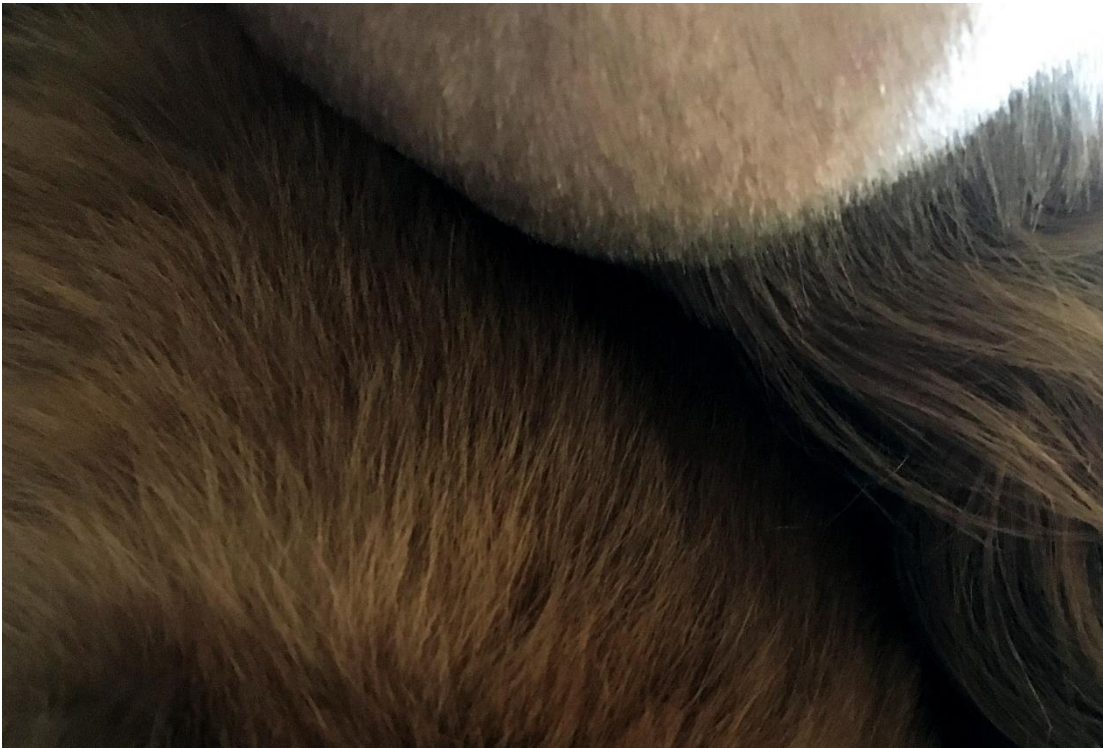
olento / olio / otus / eläin / eläjä.