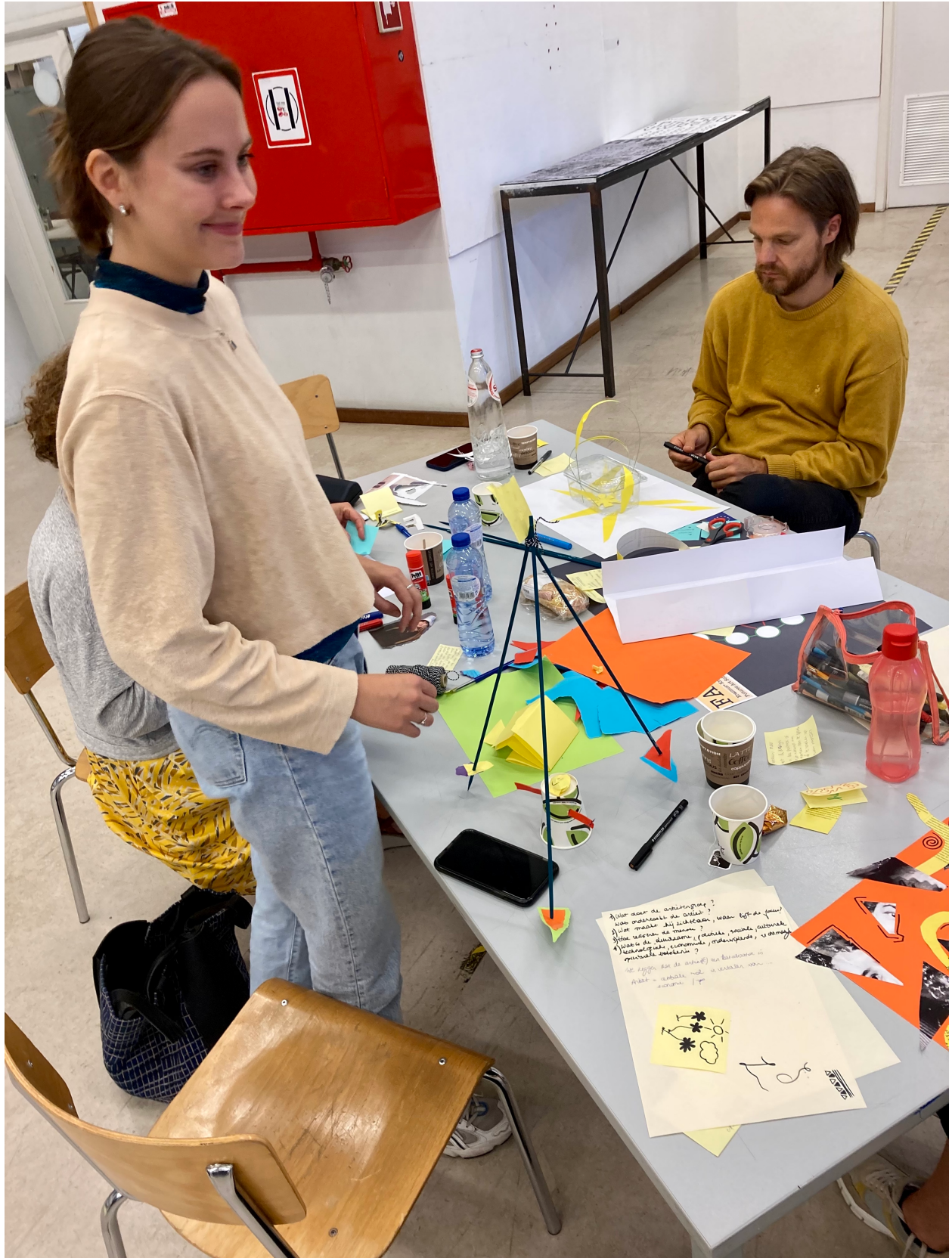
Figure 4. An installation providing a 'snapshot' of possible futures.