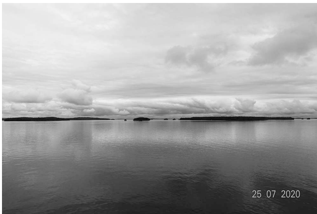
Figure 2.1 The rippling pulse of the water surface in the first hike in Varpusenlinna Island, Lake Päijänne.

deconstruct the permanence of space and time in my scenographic work and to give scenography the opportunity to emerge in the constant variation of the space-time relationship. The digitalization of scenography has been doing the same on stage for a long time, while designers' working methods have developed to be largely technology-driven. In addition to the changes produced by the dematerialization 1 of stage, my experiment raises a more ontological question of the space, place, or placelessness of the working process itself. I am asking how far scenographic work, conventionally understood as a proactive design work or a creative collaborative process, can break away from its own accustomed operating models. Is it possible for the scenographic work to distance itself from its typical event spaces – both the designer's desk and the artist collective – and literally wander into a changeable and unpredictable space-time that has no evident connection to performance context or a space of performance? At the same time, my experiment also combines a wider philosophical question of the meaning of the environment and abandons the scenographer-subject. To what extent could scenography emerge, as if peripherally, by being located away from the conventional design practices and taking place as an author-independent event?