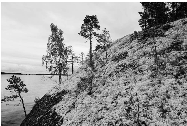
Figure 2.5 The rock formed by the Ice Age was steep and resisted wandering. Varpusenlinna, Päijänne National Park.