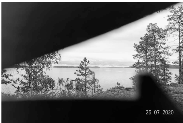
Figure 2.6 The wandering room closes the horizon.