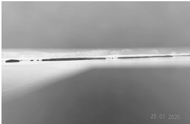
Figure 2.4 The opening of distance in a fictional space-body. Varpusenlinna Island, Lake Päijänne.