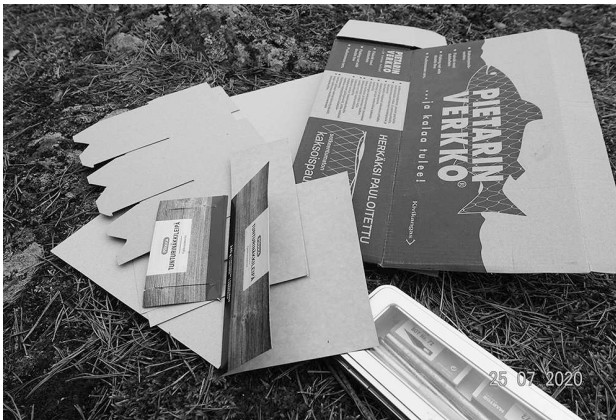
Figure 2.2 The starting points for the fictional room: Field tools and cardboard materials found in the nearby environment.

my perception. I began my research by transforming scenography in the spirit of Springgay and Truman and combining it not only with hiking but also with fiction. The phenomena of presence and absence, which are central to the distance, wandered with me in the form of a fictional room. The room was a pocket-sized piece of folded cardboard or a scale model, the essence of which was defined by the unfinished. As a physical object, the room was on the one hand present, real, and material, but at the same time also incomplete in its unfinishedness, something that exists as a possibility yet is not yet existent. The unfinishedness of the fictional room, as well as its ability to wander and change its location, drew the thinking to a speculative middle (Figure 2.2).