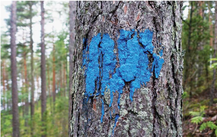
Figure 2.3 The pulses of authentic and performed nature meet in a blue route mark on a pine tree trunk. Päijätsalo, Päijänne National Park.